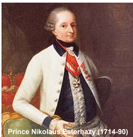
Prince Nikolaus Esterházy (1714-90)

Prince Nikolaus did not himself hire Haydn but 'inherited' him from his brother, who had appointed Haydn Vice Kapellmeister in 1761. Nikolaus promoted Haydn to full Kapellmeister in 1766. The relationship between the